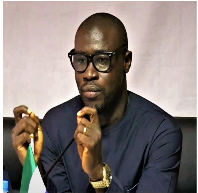
Hon. Ibrahim Tawa Conteh New Deputy Speaker of Parliament

In this edition of our weekly alert, we focus on the election of a new Speaker of Parliament following the resignation of Hon. Dr. Abass Bundu weeks ago. The extensive debates and comments made by MPs, on the Constitutional Instruments that were laid on the Floor of the House on April 18, 2024 and "The Industrial Relations and Union Act, 2023" which seeks to repeal the Regulations of Wages and the Industrial Relations Act, 1971 (Act No.18 of 1971) and the Trade Union Act (Cap221). Also is the Toll gate tariff increase and what decision was taken on it. As well as the Acting Speakers' summons and the statement made by the Parliamentary Committee on Basic and Senior Secondary Education to heads of Secondary School and other administrative work done in Parliament.