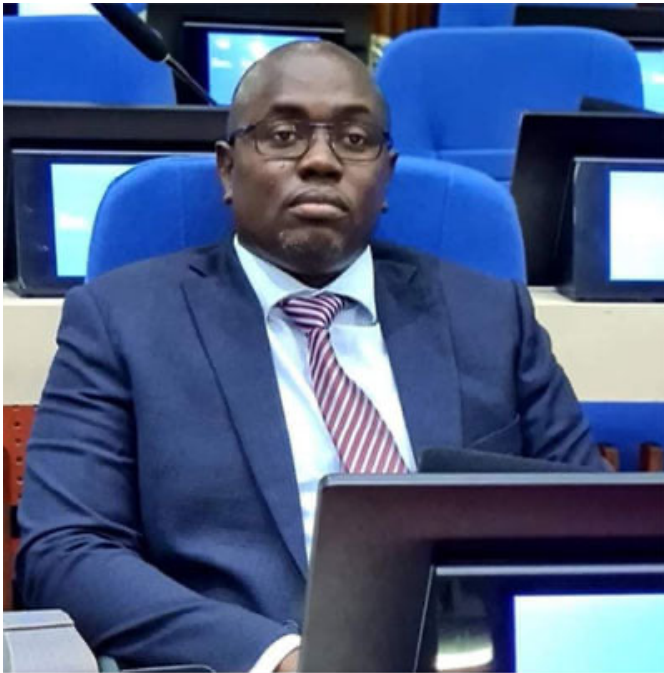
Hon. Segepoh Solomon Thomas New Speaker of Parliament