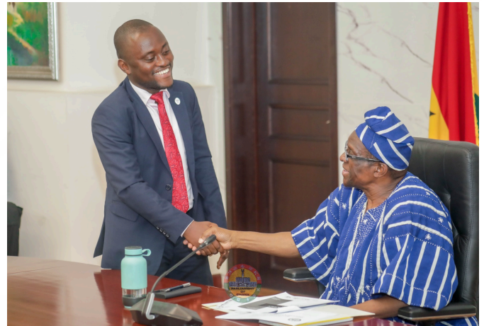
A delegation from the National Democratic Institute and the House of Democracy paid a courtesy call on the Rt. Hon. Speaker of Parliament,